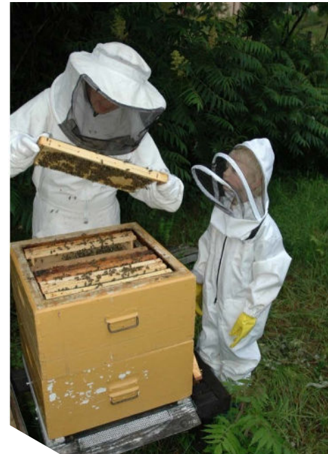
Evaluating the space needed for the honey bee colony

A strong honey bee colony can handle if the space is larger than it needs at the given time. However, a weak colony will not develop and grow in size, if the space given is too big. If this is the case, some diseases might thrive in this environment and even weaken the colony further. Always evaluate the optimal space needed by the bees to allow healthy colonies.