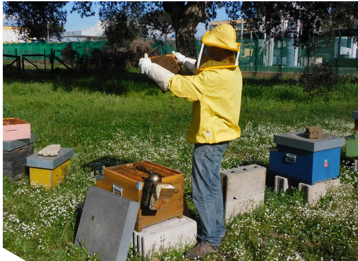
Inspecting the colony before transferring it reduces the spread of diseases

Checking the health status and maintaining healthy colonies is essential for the correct management of the colony. Carrying out inspections for honeybee diseases before transferring colonies is essential first of all to avoid spreading diseases to other apiaries as well as to optimize your work. Sick or weak colonies are not productive and if they are moved for honey production it is a waste of time and work.