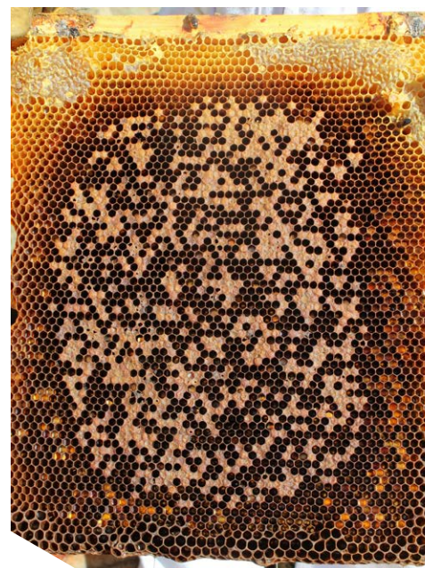
Honeybees become infected in early larval life and usually die in the pupal stage as seen in this comb

Upon detection of American Foulbrood in the apiary, it is crucial to manage asymptomatic colonies properly. Tests should be conducted to detect the presence of the disease and increase visual inspections. If the presence of the disease is confirmed, drastic measures should be taken, such as separating the affected hives and moving them to a hospital apiary. Additionally, provisional measures need to be established to control the spread of the disease and maintain constant vigilance.