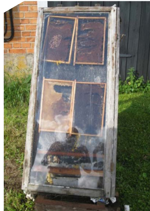
Old frames from the brood chamber were removed and melted down in solar melting equipment

If you have damaged or old frames (old wax combs from the brood nest), make sure that you remove them and replace them with new fresh ones before the wintering period. This is to prevent bee diseases from developing in the colony or providing drone brood to be produced in excess, which is beneficial for the reproduction of varroa.