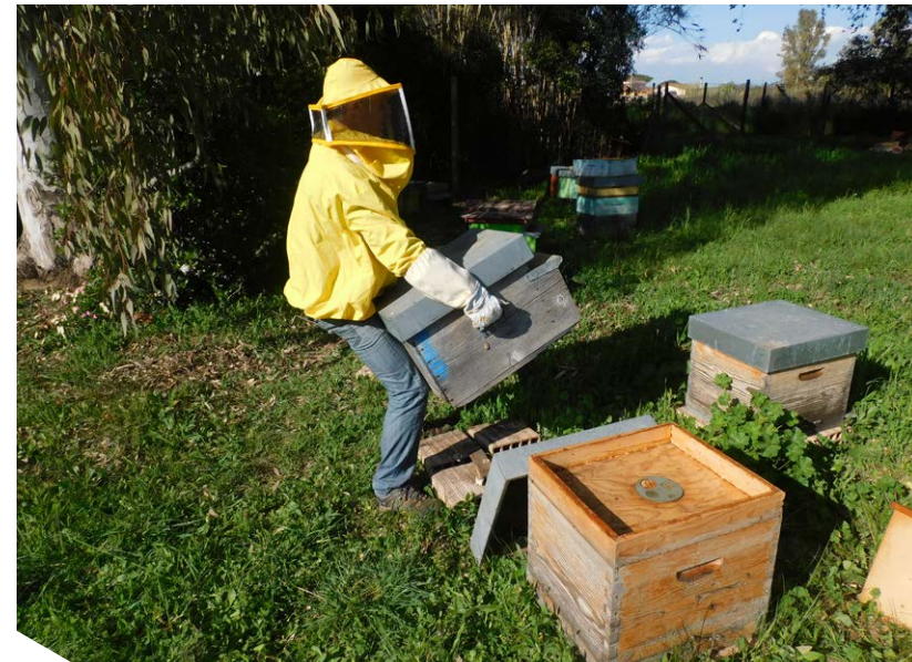
Removing diseased colony avoids spread of diseases

A diseased colony is a real and potential danger for the other colonies of the same apiary and also of the other ones nearby. The disease can be spread by the usual honeybees' activities and by the beekeeper's management practices, first of all by producing new artificial swarms. Elimination of the weakest or the colonies that cannot be treated is an efficient measure for the hygiene and disease prevention.