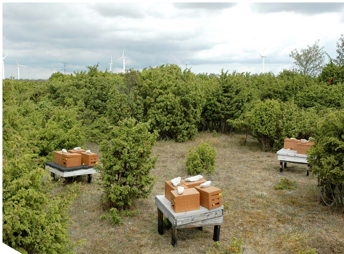
Mating boxes for queens

It is important to control the quality of the colonies that you plan to produce new queens from. It is equally important to check the quality of the colonies providing the drones mating with the queens.