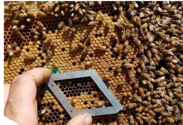
Pin-test. An important method to evaluate the hygienic behaviour of the queen

Using good queens is very important for a correct management in beekeeping. Queens are healthy if they are productive, resistant to diseases and adapted to local conditions. Genetic selection is central to obtain that. Better if it is done on the same honeybee population of the apiary. Otherwise it is recommended buying queens from breeders that raise queens in the same area.