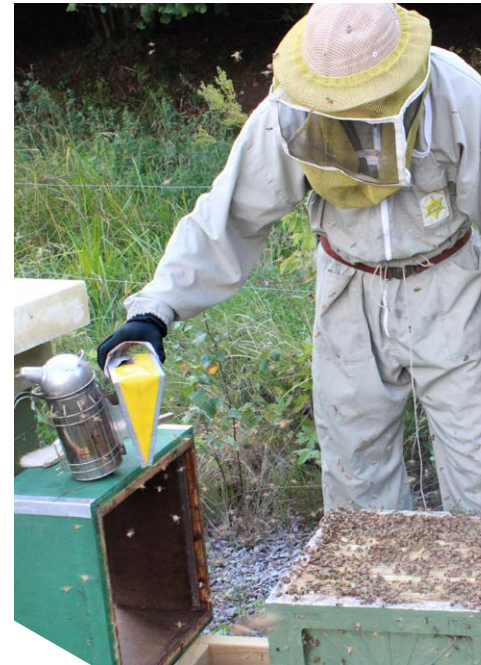
Evaluation of the honey bee colony

To keep healthy honey bees, inspections of the brood chamber and the food storage are important. This evaluation cannot be done just by checking if the bees are flying or not. The hive needs to be opened, and an internal evaluation of the actual situation needs to be done. This is to be able to take the right measures that will support the development of the colony.