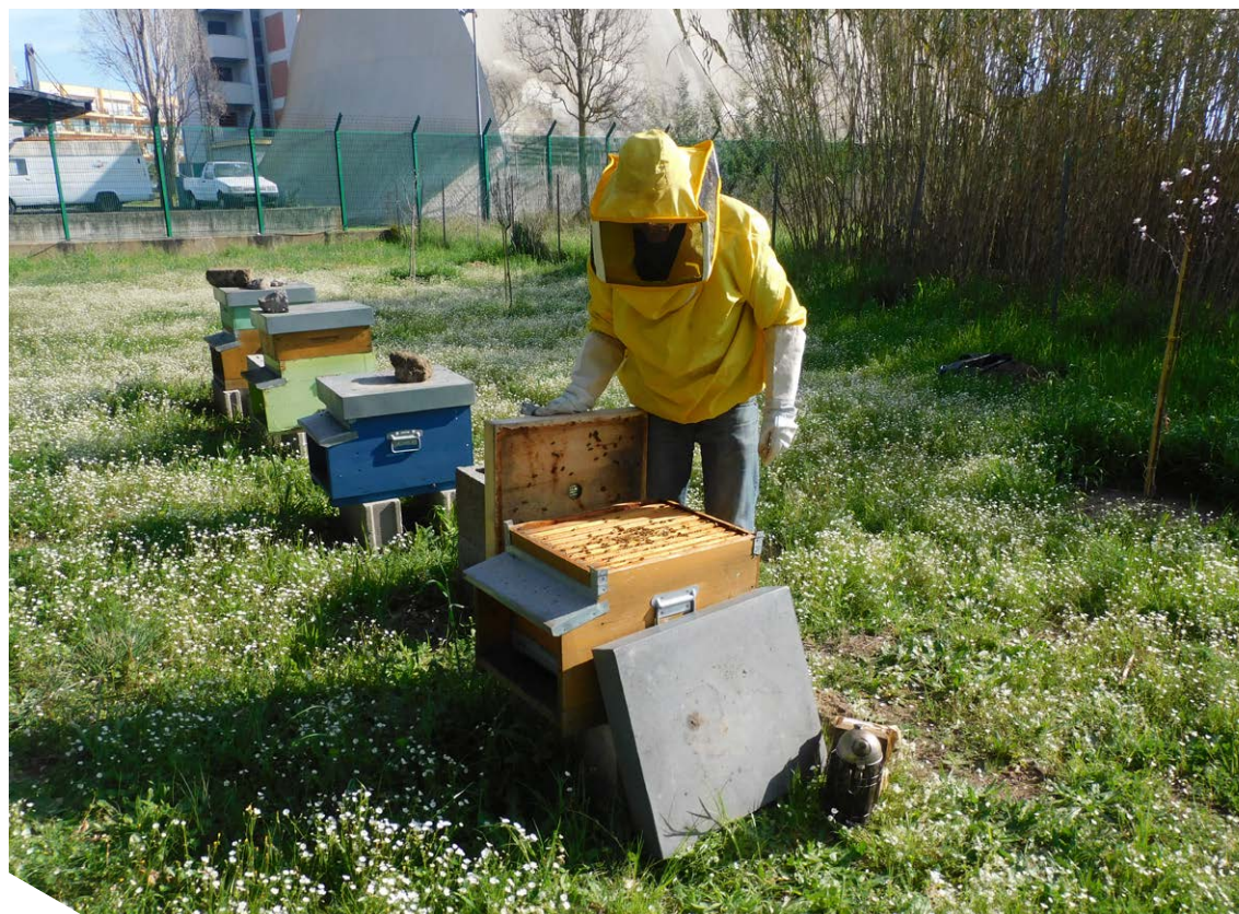
Inspecting colonies in suitable weather conditions reduces stress on the bees

Inspection of the colonies is an essential activity for monitoring the development and the health of the beehive. Although it could be necessary visiting a colony also with critical weather conditions, inspecting beehives during suitable weather conditions - that is when the honeybees fly - is better to reduce the stress both for the honeybees and for the beekeeper. During bad weather conditions, honeybees are generally more aggressive and there is also the concrete risk of exposing the brood to a drop in temperature.