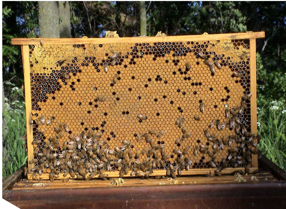
Frame with healthy brood

To avoid the transfer of diseases between honey bee colonies, the beekeeper needs to make sure that frames of brood or adult honey bees come from colonies without any symptoms of disease.