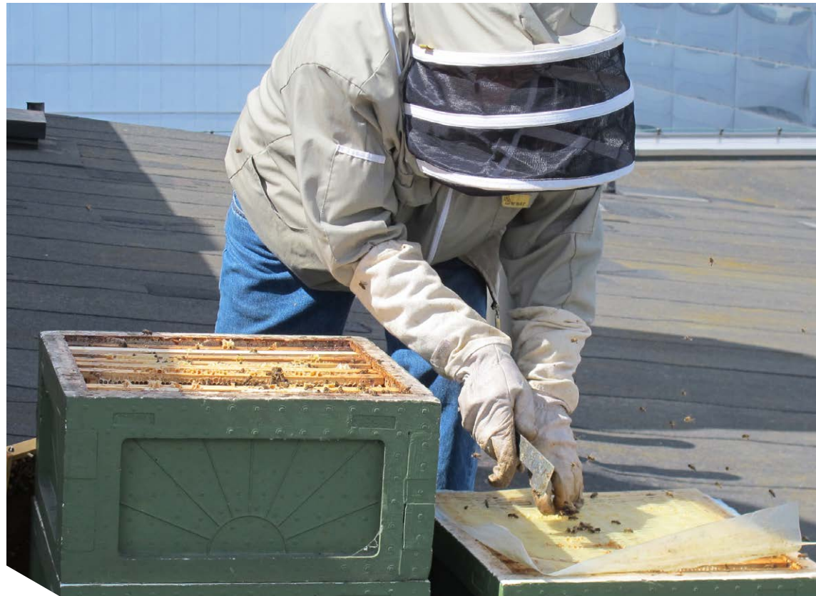
Expanding the honey bee colony

When spring comes, the queen will start laying eggs and the colony will grow. To allow the full development of the colony and to prevent swarming extra space is needed for both brood, bees, pollen and honey.