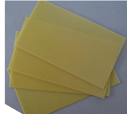
New wax foundations