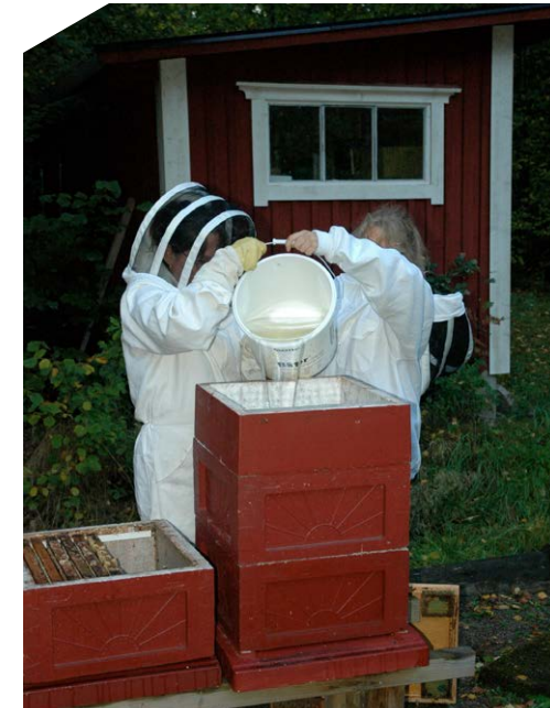
Feeding sugar solution