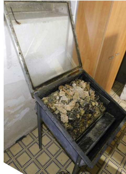
Removed old wax can be used for producing new wax foundations

The management of the beeswax is essential to guarantee suitable combs and for beeswax production. The oldest or unsuitable combs (too dark, damaged, broken, mouldy, etc.) can be removed in autumn or early spring when they are empty. The new ones have to be added during the spring development. The old combs can be melted to produce beeswax for sale or for the new sheets of wax foundations.