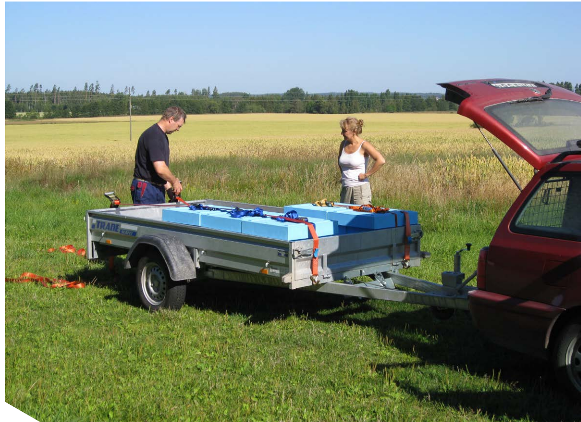
Transport of honey bee colonies

When moving honey bee colonies from one place to another, national regulations regarding restrictions of movements must be followed at all times. Contact the national responsible authorities for the latest updates of the regulations.