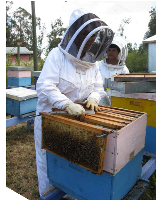
Colony inspection