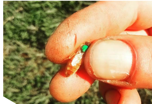
Replacing a queen with a selected one can be essential for a healthy colony

The tolerance to varroa infestation or to other diseases can be due to the honeybee queen. In case of inadequate level of tolerance, it could be useful to replace the queen. To evaluate the hygienic performance of the queen (and the colony) the pin test is a good method. This technique consists of piercing with a pin pad a comb section of 50 capped cells and checking how many of them have been removed by the bees. The more dead cells are removed, the higher is the hygienic behaviour.