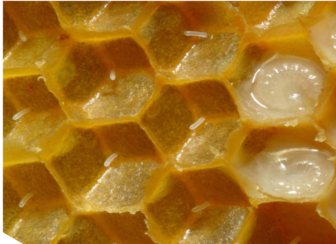
Checking the eggs and larvae presence for evaluation of mating success

When we raise or rear a new queen, for own use or for sale, it is necessary to evaluate if she is mated and performs an adequate oviposition. Visual inspection of the behaviour of the queen and the number and distribution of the eggs laid is the best way to evaluate the queen performance.