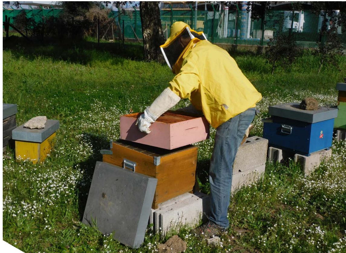
Adding supers prevents swarming and increases honey production

Adding honey supers is useful for both swarming prevention and honey production. The honey supers increase the hive volume and give more space for the honey storage. The lack of space is one of the causes of the swarming and the production loss. On one hand, the space becomes insufficient for the brood and on the other hand if the space is limited for honey storage the honeybees stop collecting nectar. Anyway, the honey supers have to be added at the right time of the colony's development.