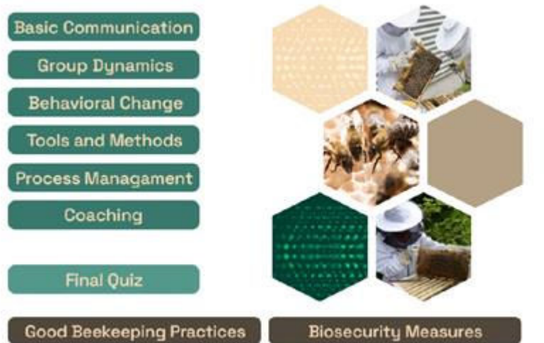
Figure 2 OER training modules at the platform Canvas, SLU